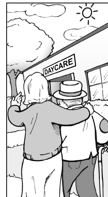
Adapted from: The Comfort of Home: Caregiver Series, © 2018 CareTrust Publications. www.comfortofhome.com